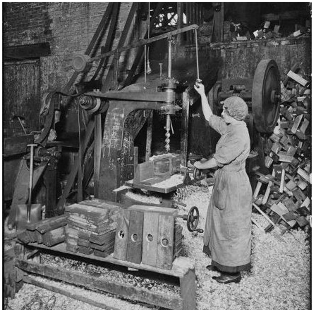
Spooled File Conversion